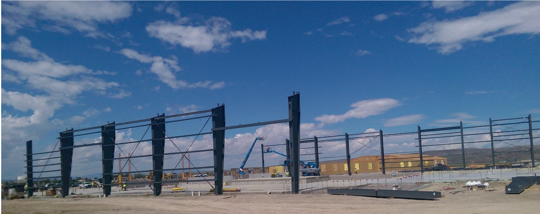
Commons and Gym steel columns